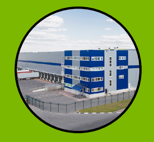
Businesses and Industrial