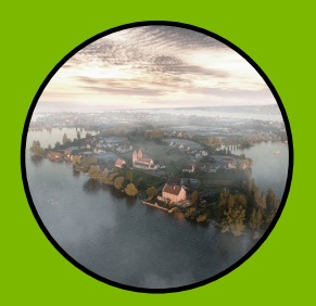
Remote Islands and Towns

Across the world there are many communities without access to reliable power or electricity. Our turbine systems can be shipped anywhere and installed quickly to re-store power, aid in emergency situations, recover lost communications and supplement existing solar options.